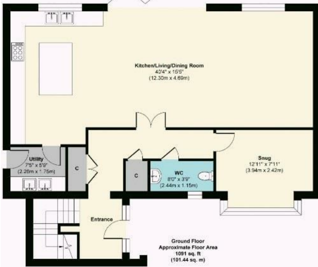
Ground Floor Approximate Floor Area 1091 sq. ft (101.44 sq. m)