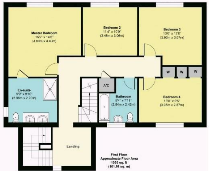
First Floor Approximate Floor Area 1093 sq. ft (101.56 sq. m)

Approx. Gross Internal Floor Area 2737 sq. ft / 254.38 sq. m