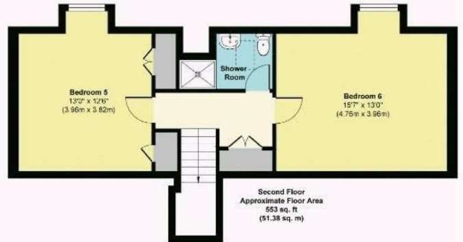
Second Floor Approximate Floor Area 553 sq. ft (51.38 sq. m)